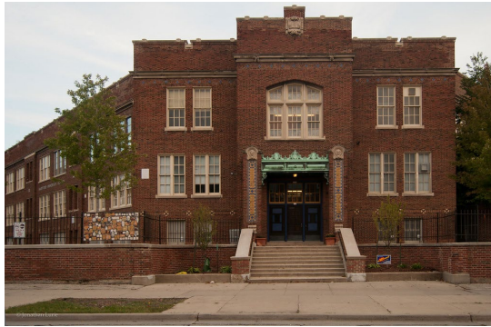
Hartford Avenue University School