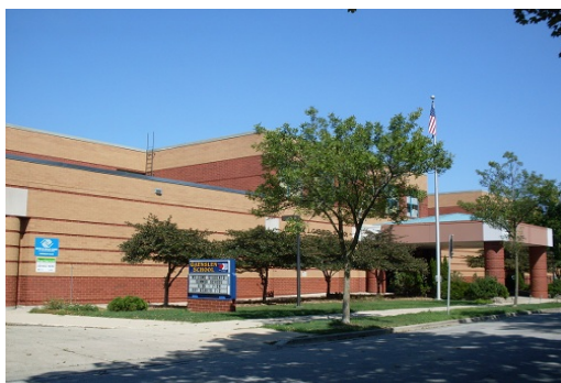
Frederick J. Gaenslen School