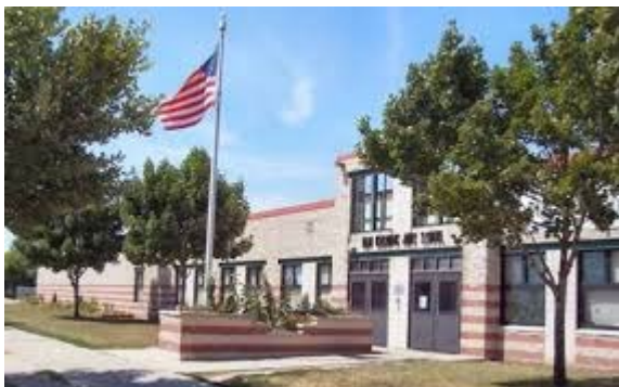
Elm Creative Arts